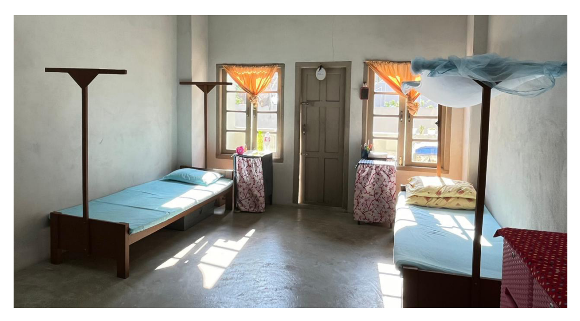
XVIII. FACILITIES FOR STUDENTS

2. Nursing teacher with minimum of five years of teaching/clinical teaching experience in a particular subject/clinical area may be appointed as practical examiner.