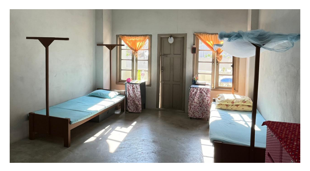
XVIII. FACILITIES FOR STUDENTS