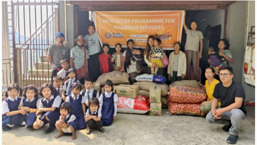
DURLANG REFUGEE CAMP