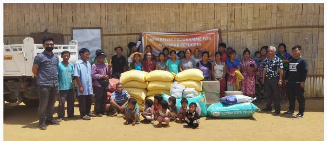
SIHHMUI REFUGEE CAMP

Items Distributed: 45 bags of rice, Nutrella, Dal, cooking oil, Vegetable seeds, biscuits, sanitary pads and other basic needs.